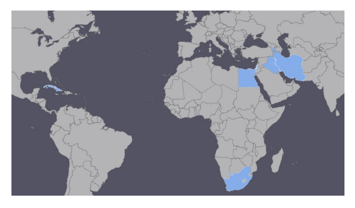
International Digital Ephemera Project Member States

The International Digital Ephemera Project is funded privately by the Arcadia Fund.